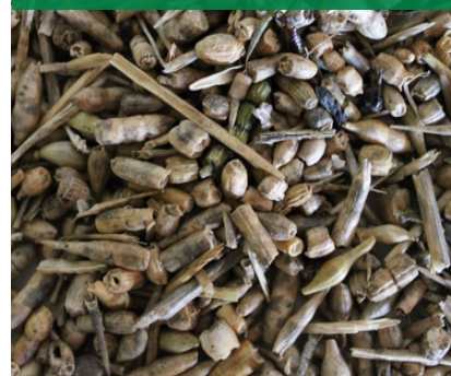
Wild radish contamination can cost up to $50/t at harvest